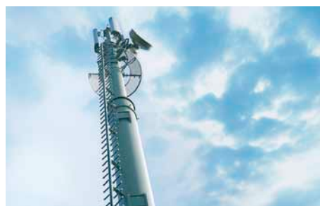
Mobile radio aerial installation