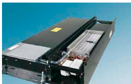
Decentralised air conditioning unit